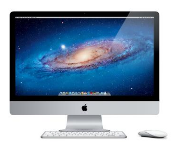
Part 1 Prelim Part 2 Introduction